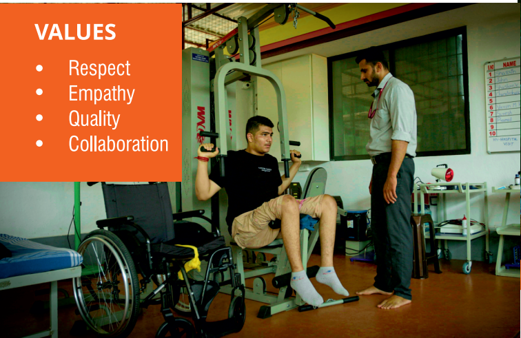
Sevadhama a beacon of light in the life of Persons with Spinal Cord Injury